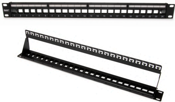
P/N 641-24U | Unshielded Unloaded Patch Panel 24 Port 24 port, 1U, UTP, 19 in.