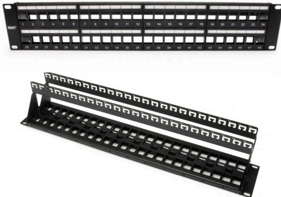
P/N 643-48U | Unshielded Unloaded Patch Panel 48 Port 48 port, 2U, UTP, 19 in.