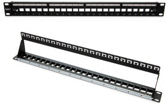
P/N 642-24SU | Shielded Unloaded Patch Panel 24 Port 24 port, 1U, STP, 19 in.