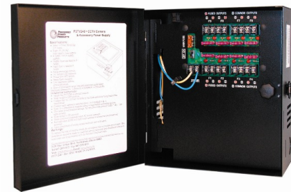
Model CP824-4UL (4 Amp)