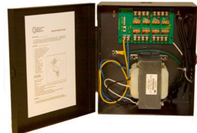
Model CP824-12 (12.5 Amp)

Design and specifications subject to change with out notice. Conversions: 1" = 25.4mm Measurement conversions are approximate.