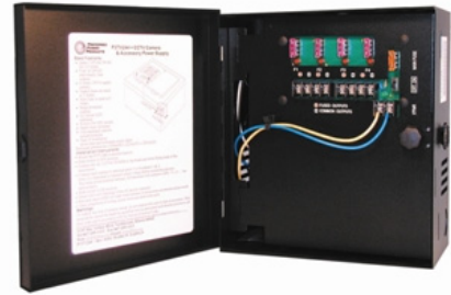
Model: CP424-4UL (4 Amp)