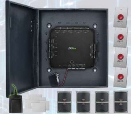
Atlas400-4 Door KIT