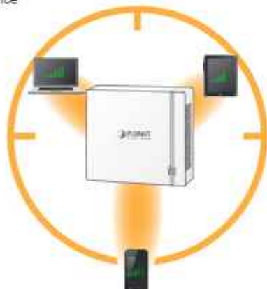
Dedicated and stable signals