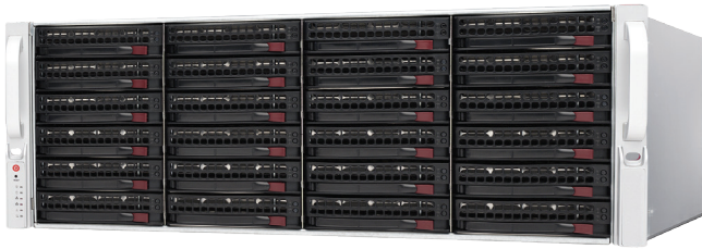
DW-BJE2U DW-BJER2U DW-BJER3U DW-BJER4U (shown)