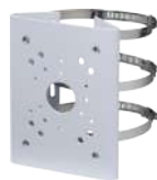
AVM-PT-PMT-T25 POLE MOUNT