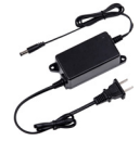
DH-PFM321D-US Power Adapter