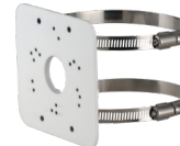
PFA152-E Pole Mount