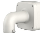
PFB302S Wall Mount