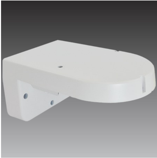
L-Type Wall Mount (for I91, I92, KCM-8111)