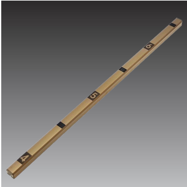
Height Strip Mount (Bronze) for L-Shape Pinhole Covert Cameras