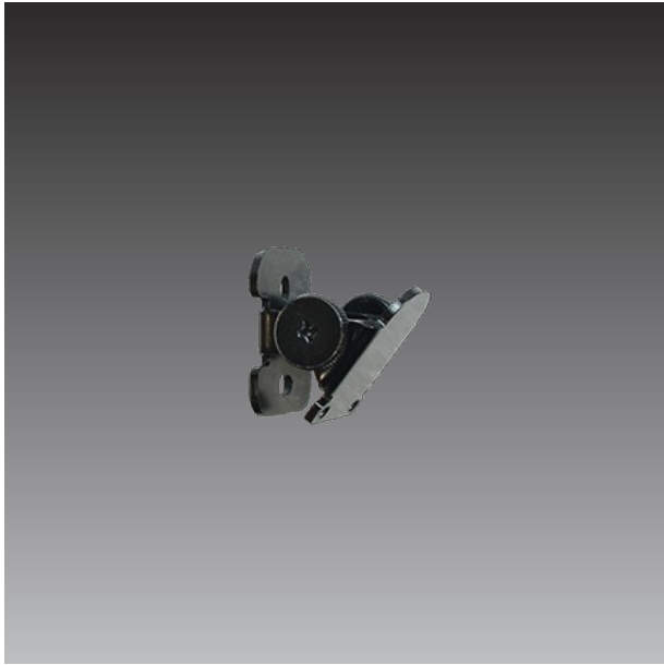
Tiltable Surface Mount for L-Shape Pinhole Covert Cameras