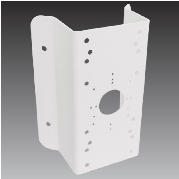
Corner Mount (for A416, A418, B419-P2)