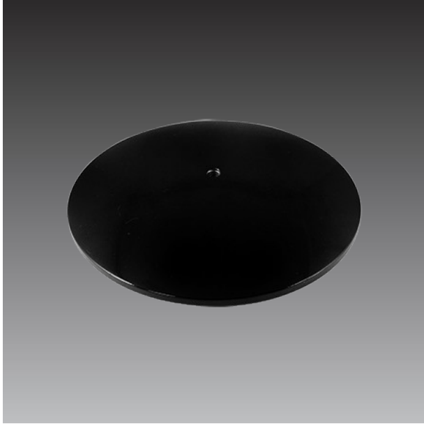
Desktop Mount Magnetic Base for Micro Box Cameras