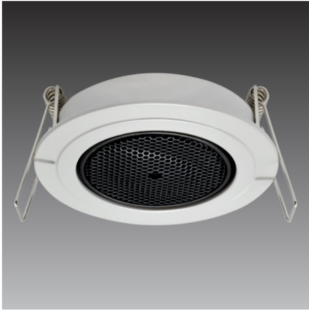
Tiltable Flush Mount for Pinhole Covert Cameras