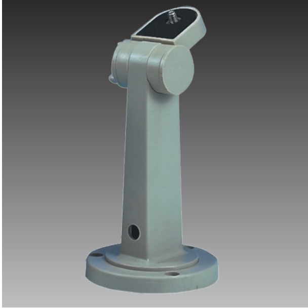
Bracket for Indoor Box Cameras