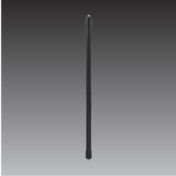
Gooseneck Bracket for Micro Box Cameras