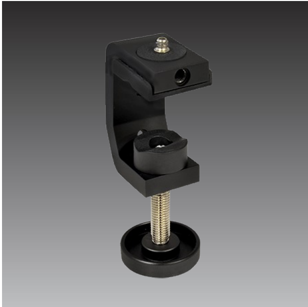
Edge Clamp for Micro Box Cameras