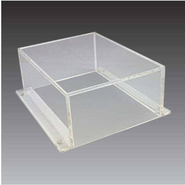
Acrylic Box (for R11C-30)