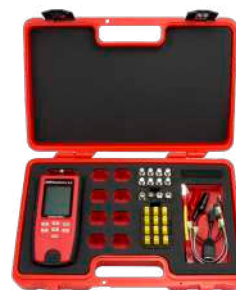
T130K4 Network & Coax Field Kit