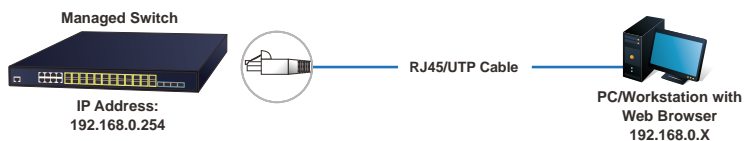
Figure 5-1 IP Management Diagram

The Managed Switch provides a built-in browser interface. You can manage it remotely by having a remote host with Web browser, such as Google Chrome, Mozilla Firefox, Google Chrome or Apple Safari.