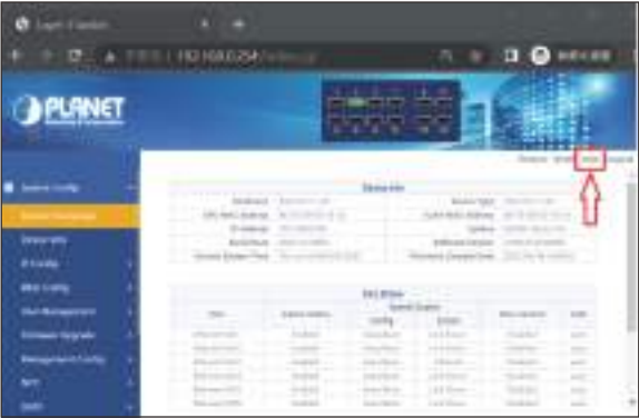
Figure 5-4 Save Configuration

To save the configuration, you have to click "Save" on the top control bar. "Save" function is equivalent to the execution of the write command.