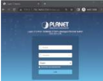
Figure 5-2 Login Screen