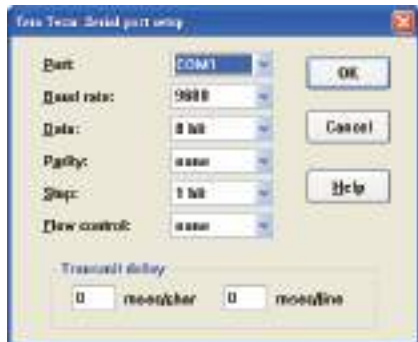
Figure 4-2 Tera Term COM Port Configuration