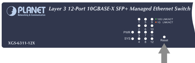
Figure 6-1 XGS-6311/GS-6311/MGS-6311 Series Reset Button

To reset the IP address to the default IP address “ 192.168.0.254 ” or reset the login password to default value, press the hardware-based reset button on the front panel for about 10 seconds . After the device is rebooted, you can log in the management Web interface within the same subnet of 192.168.0.xx.