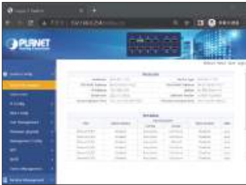
Figure 5-3 Web Main Screen of Managed Switch