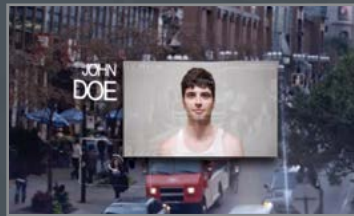
Facial Recognition Events